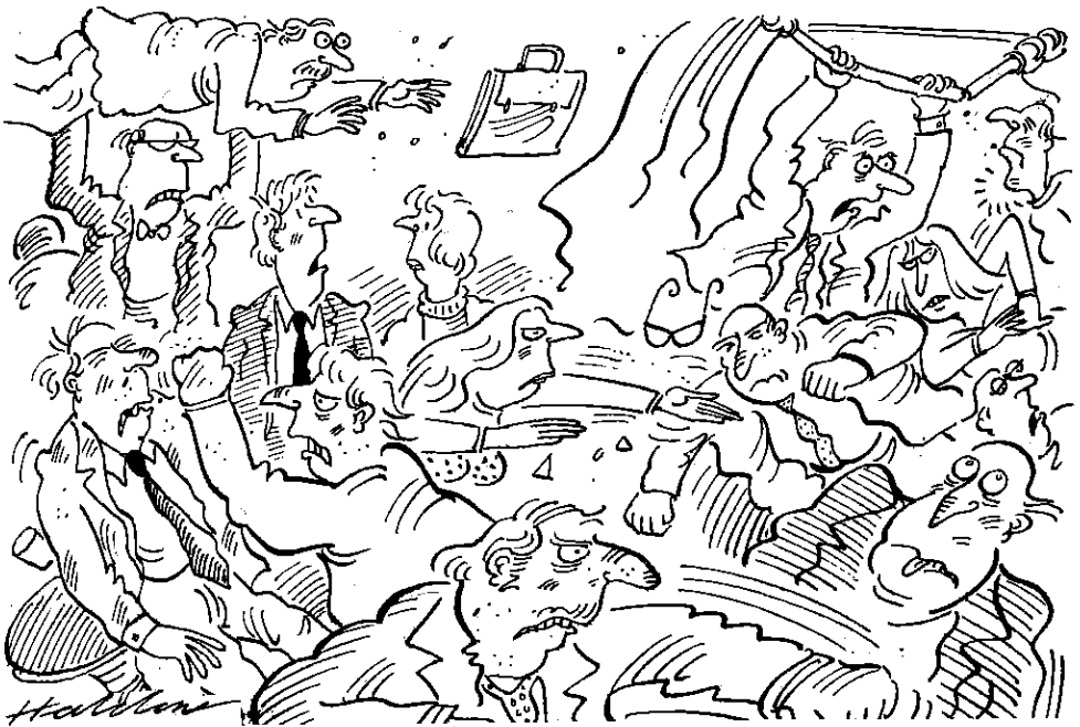
The Community considering its Common Agricultural Policy

Our attitude to the future development of the EEC must be based on our long-term goal of the new Europe of the Regions. In the short-term, however, much can be done to expose the grossly unecological and damaging nature of the EEC and to publicise the need for a different sort of Europe. That is why, although in favour of withdrawal from the EEC, Ecology Party members are standing for election to the European Parliament. We believe that, in that Parliament, we have an institution which provides a forum for debate about the future shape of the EEC and a potential power base from which to expose and challenge some of the worst excesses of the EEC. It is for these reasons that this Manifesto contains an Action Plan for Change, and why the European Greens standing in this election have pledged to work together in the Parliament on the basis of the Common Manifesto – "Towards a Green Europe".